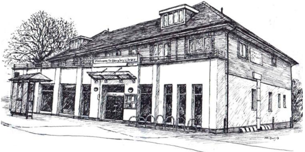
Langley Library, Trelawney Avenue

A FREE MAGAZINE published by the Langley Churches for the people of Langley