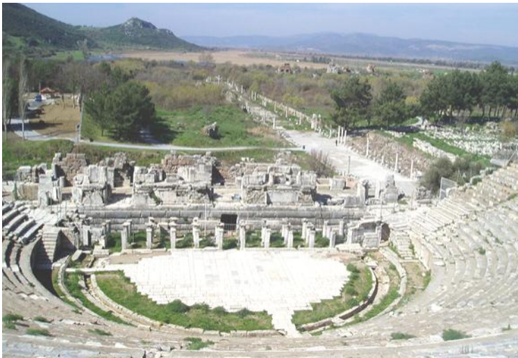
The Theatre in Ephesus

There follows then a long list of instructions about Authority and Submission, opening with 'Submit to one another out of reverence for Christ'. Two thousand years later, many of us may find it difficult to accept the exhortation, 'as the church submits